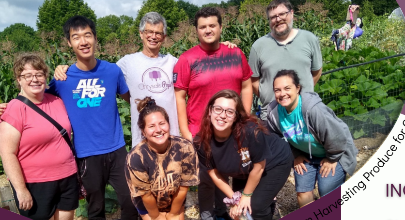
IPS Team Harvesting Produce for Chrysalis Pops