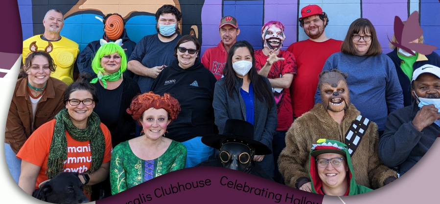
Chrysalis Clubhouse Celebrating Halloween

Your support makes a huge difference in supporting wellness and recovery. Donations can be mailed or made online by visiting www.workwithchrysalis.org